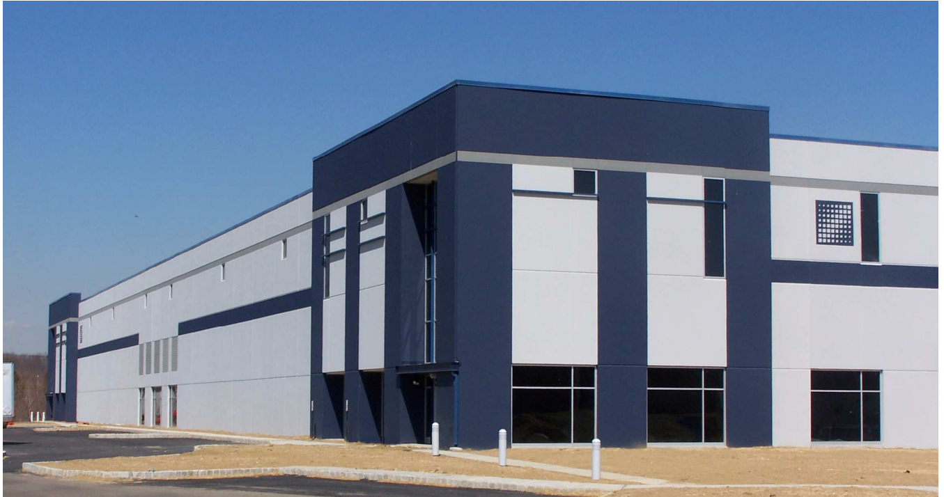
SW Corner Elevation - Under Construction